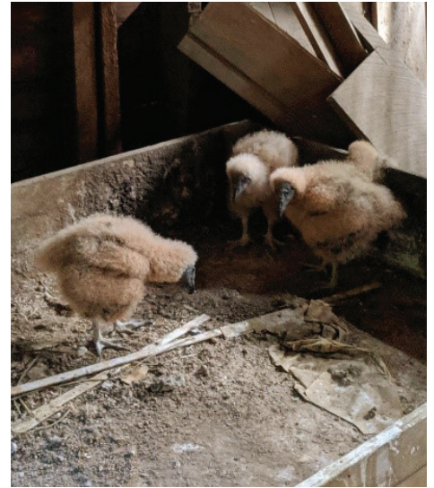
A successful reunion!