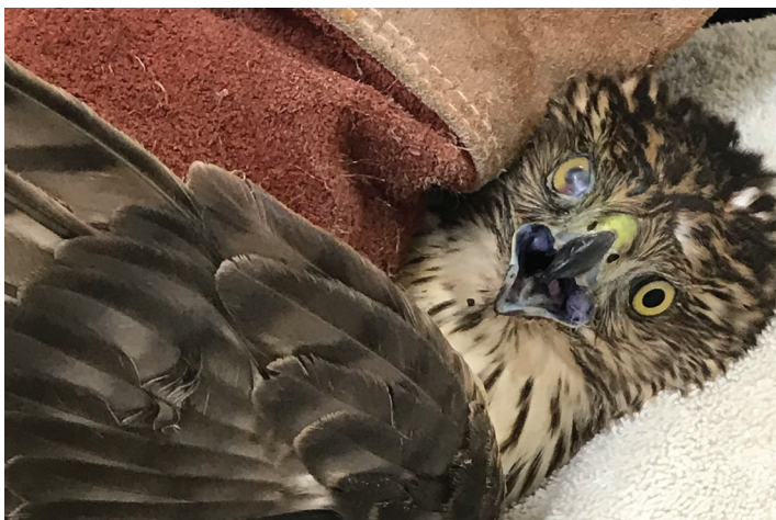
Abnormality in right eye before treatment

On December 31, 2019, the bird was returned to Northern Kentucky, but nowhere near the lime company! Thanks so much to everyone who worked together to help this severely injured Cooper's Hawk return to the wild.