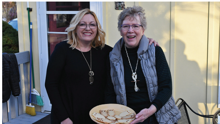
No release celebration is complete without owl-shaped cookies

The Kilgore's returned home and contacted their daughter-in-law, Kipra. They informed her about their owl adventure and they all decided to try to catch the owl again after breakfast. Kipra arrived prepared with boots, gloves, and a determined spirit. Equipped with walking sticks, a sheet, and a large box, the trio set off. Tom located the bird in a branch of a fallen tree not far off the ground, but again, the bird began to hop farther up the creek. The creek was not in