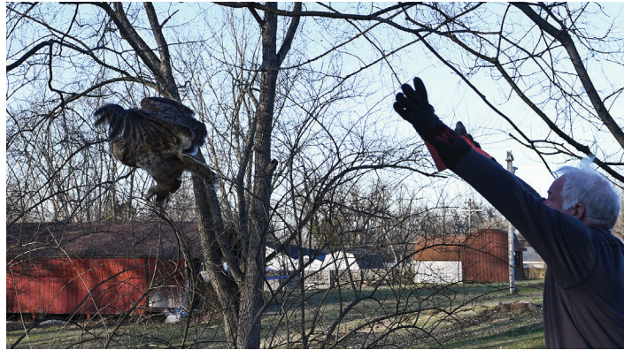
Kipra wasted no time once she was released

When Jackie arrived, she was armed with long thick gloves and a towel. She climbed down to the creek bed and attempted to throw the towel over the bird. Unfortunately, the owl kept hopping just out of reach. Several attempts were made to catch the bird, but the owl's small size and desire not to be captured kept it moving farther down the creek bed and into denser foliage. Soon the terrain became impassable. Jackie advised to keep watching for the bird and if it came back up to an accessible area (like near the neighbor's chicken coop), we could try again to catch it.