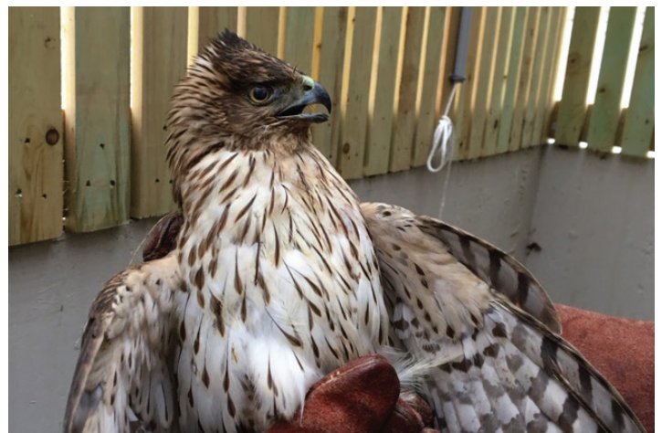
Eye after treatment and ready for release