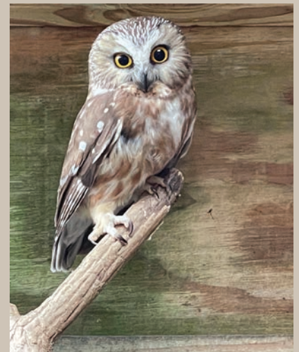
Before release

Considered to be a less-common bird found in Kentucky, our data were submitted to the Kentucky Ornithological Society Bird Records Committee for documentation.