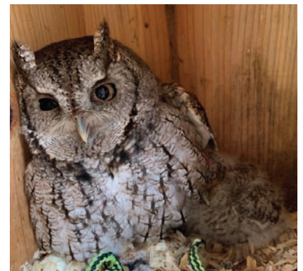
Athena with owlet