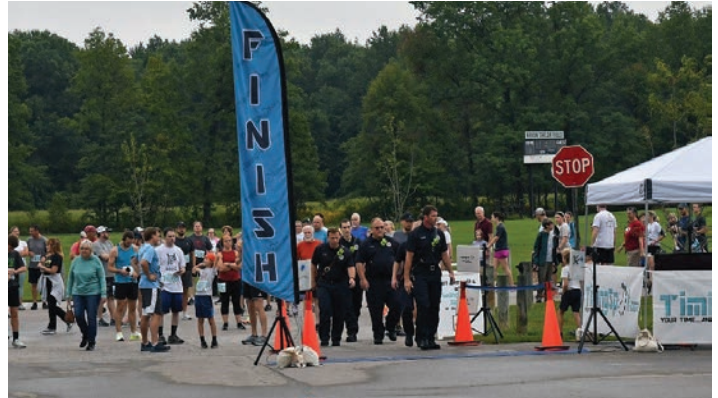
Miami Township Fire & EMS help get the event underway.

Thank you to our event sponsors: Hadronics, The Animal Eye Institute, Whistle Stop Clay Works, Wild Birds Unlimited – West Chester, Children’s Meeting House, Angel’s House of Music, and Tri-State Running Company.