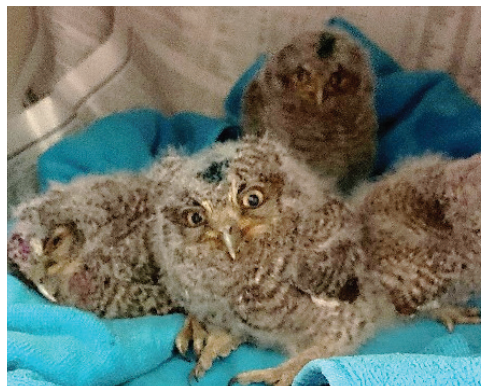
Owlets on admission

Once the owlets were flying well, they were given the opportunity to catch live prey. Each mastered the task quickly and after three months of care, the owlets were banded and released in Goshen, OH, on August 19, 2022.