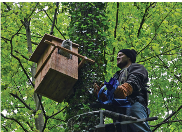
Barred owl relocation after nest destroyed.