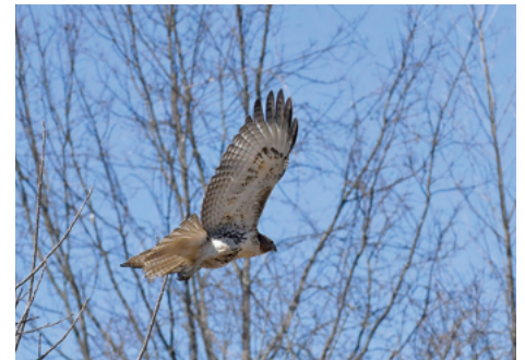
The hawk lifts off.