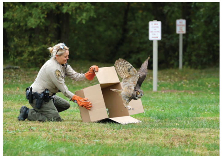
Great horned owl release.