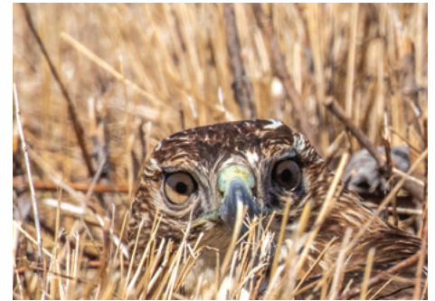
Hawk camouflaged.

And then, suddenly, the hawk soared. For what seemed like ages, the hawk circled above us, moving higher and higher, until it was just a dot in the sky.