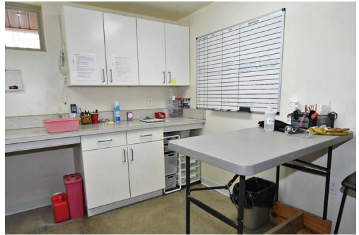
New Critical Care Room

We also now have room to have the incubation chamber in the critical care room, where it is much easier to monitor birds needing additional heat and humidity.