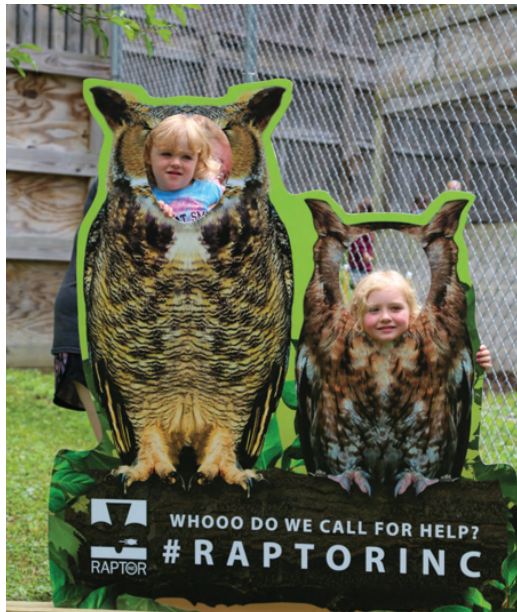
Kids love the owl standee!