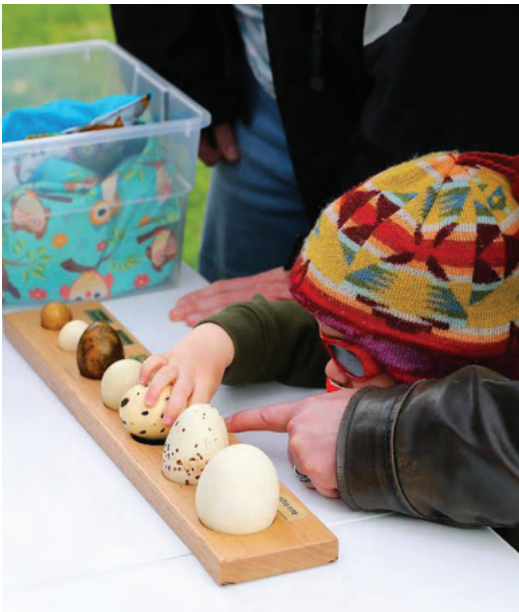
Our new egg display!