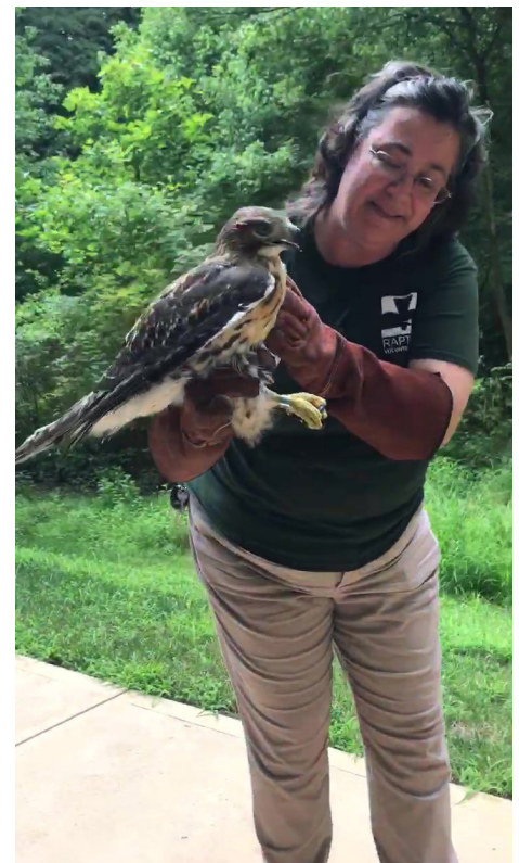
RELEASE AT DEUPREE HOUSE

Thanks to the many people who took the time to get involved, this young hawk received a second chance.