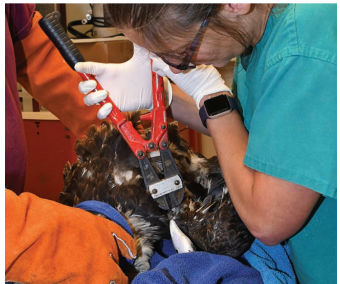
Dr. Cummings removing a fish hook from a bald eagle.